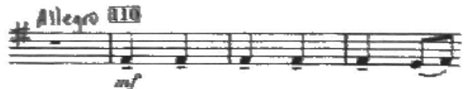
French Horn Excerpt #2 Kabalevsky Suite